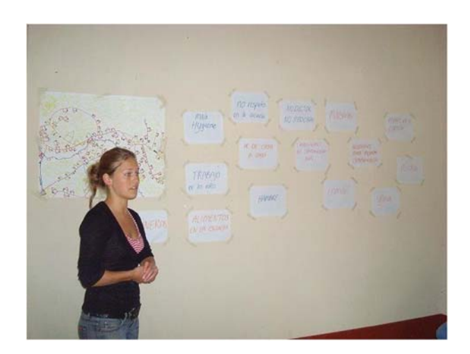
Figure 3 The final generic meeting.

Then, the feasibility of the plans was discussed on how to accomplish them to make the joint construct complete. From observations it can be stated that there was a relaxed atmosphere during the meeting, most probably because of the awareness of the participants that they all had the same background theories and normative preferences and because presented solutions of the second argumentative circle were considered meaningful by all stakeholders. The discussion between different stakeholders led to agreement on solutions