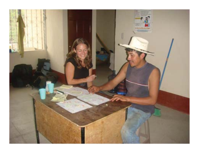
Figure 2 The reframing process. Meeting with a father.

The principal aim of the final generic meeting was constructing a specific plan for the SCW-Group that would tackle the main health problems by their roots. As the deeper cause of health problems was the lack of communication among different stakeholders, the plan was mainly focused on improving communication. For this meeting, all different stakeholders were invited to come together to discuss disagreements and to make plans for the SCW-Group.