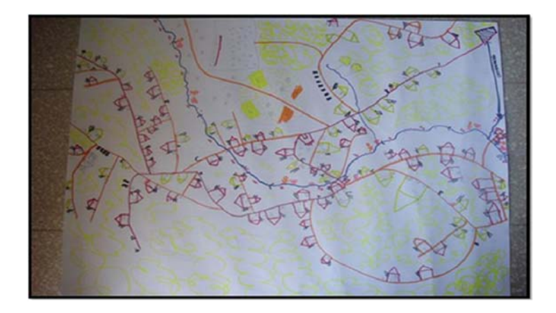
Figure 1 The village map. Houses were drawn red (loam) orange (wood) or yellow (stone). Numbers in the houses indicate the number of children living in that household and/or the number of children that died in that family. Places where people wash themselves are indicated with stick-men. The degree of river contamination was indicated by: +, little contaminated; ++, contaminated; and +++, very contaminated. Furthermore, the way of cooking was indicated, shops, surroundings, etc.

Lack of water was mentioned by all stakeholders to be a serious problem in Llano Largo and all participants share the same value on the importance of water for human health. The primary school also suffers from this lack of hygiene. A member of the committee holds the mayor responsible for this lack of water: